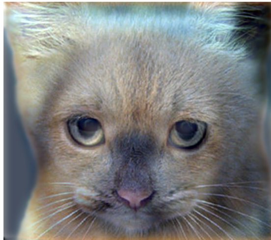
Figure 2: Look at the image from very close, then from far away.