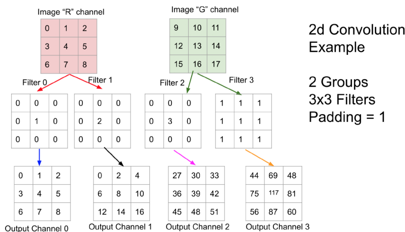
Figure 1: Visualization of a simple example using groups=2.

We demonstrate the effect of the value of the groups parameter on a simple example with an input image of shape (1, 2, 3, 3) and a kernel of shape (4, 1, 3, 3) :